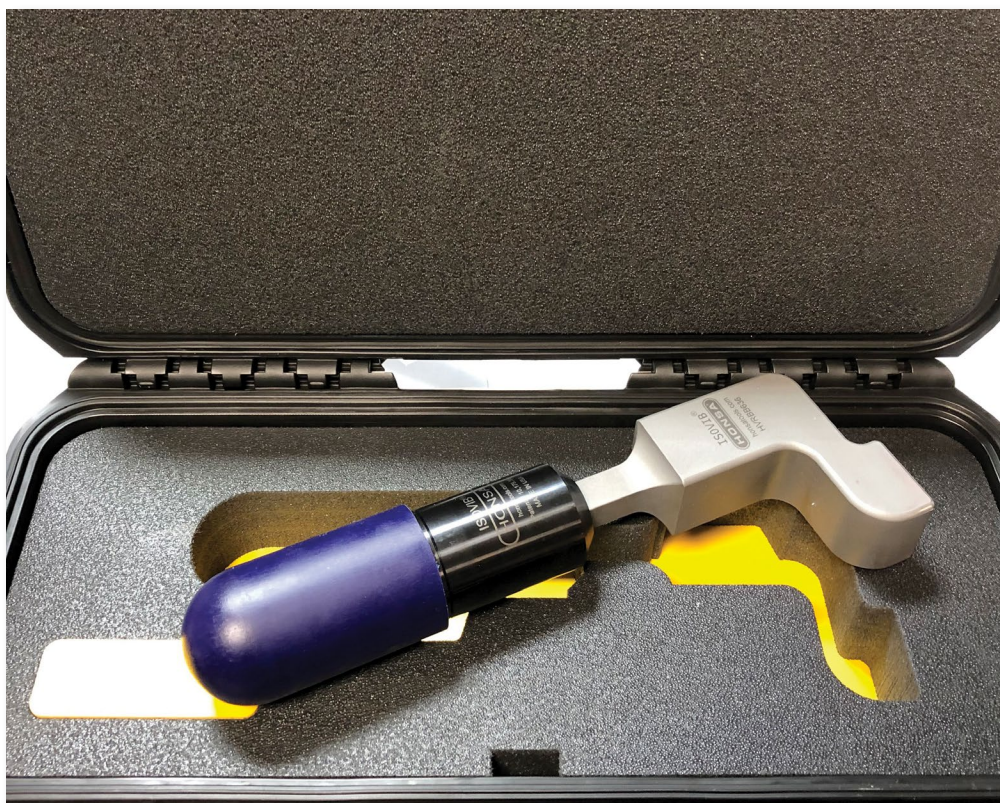
Customization of the modular bucking bar with interchangeable end effectors allows operators to reach a wide variety of difficult rivets.

to improve safety and ergonomics in its facilities. Through implementing industry best practices, Borcicky said that the Fleet Readiness Center East base was able to reduce carpal tunnel syndrome cases from 50 to 0 annually.