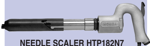
NEEDLE SCALER HTP182N7

Vibration Reduced Needle Scaler with 7” Needles, 15/16” Bore, 1-1/16” Stroke, 4000 BPM, Octagon Shank, 1/4” Inlet, Gooseneck Handle, 8.7 lbs., 22” OAL